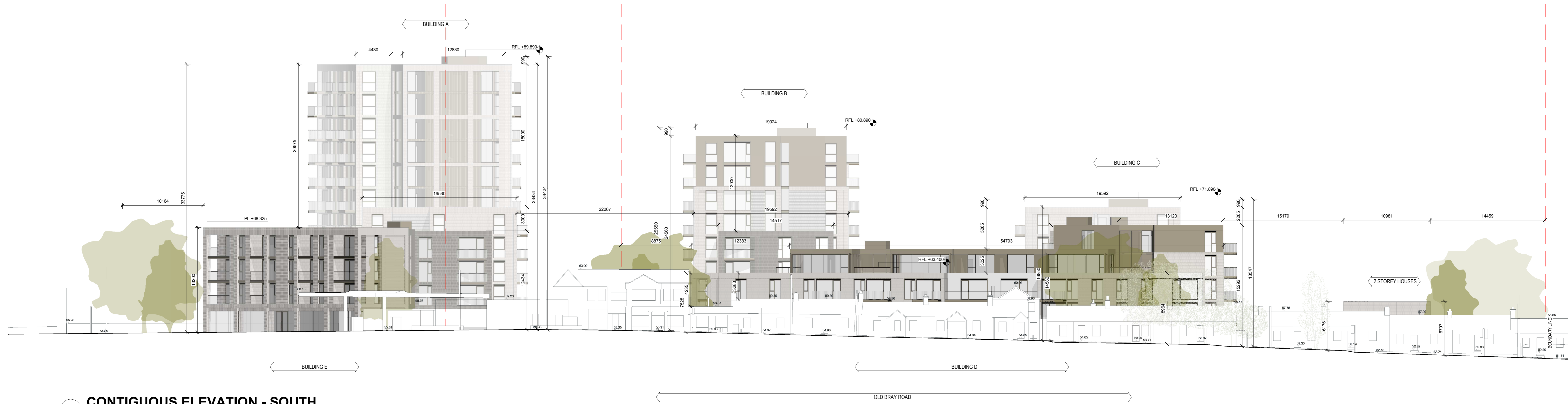
1 CONTIGUOUS ELEVATION - SOUTH 1 : 200